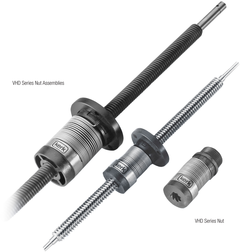
VHD Series Nut