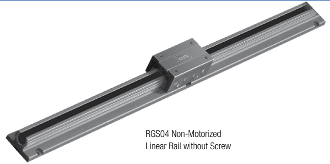
RGS04 Non-Motorized Linear Rail without Screw