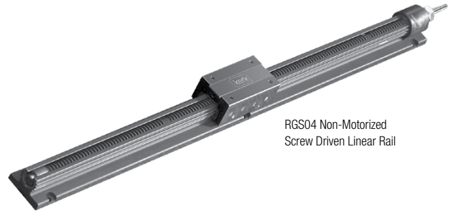
RGS04 Non-Motorized Screw Driven Linear Rail

The non-motorized RGS Series features standard wear compensating, anti-backlash driven carriages to ensure repeatable and accurate positioning. All moving surfaces include Kerkite® engineered polymers running on Kerkote® TFE coating, providing a strong, stable platform for a variety of linear motion applications.