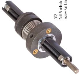
SRZ Anti-Backlash Screw Rail Linear Actuator

By eliminating the need for external rail-to-screw alignment, the Screw Rail simplifies the design, manufacture and assembly of motion systems. The coaxial design saves as much as 80% of the space used by a two-rail system and is generally less expensive than the equivalent components purchased separately. An added benefit is the ability to get "inertial" motion from a single Screw Rail.